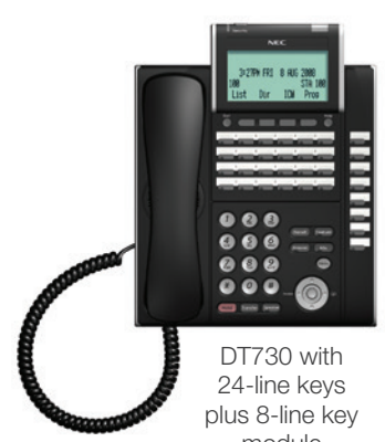
DT730 with 24-line keys plus 8-line key module