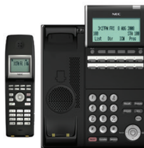
DT330 with Bluetooth Cordless Handset