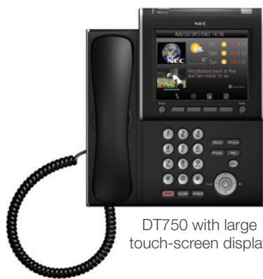
DT750 with large touch-screen display