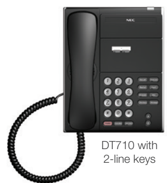
DT710 with 2-line keys