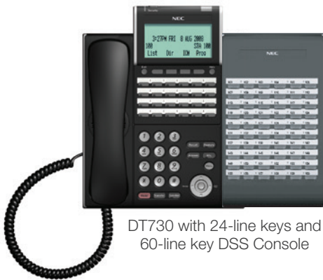
DT730 with 24-line keys and 60-line key DSS Console

Most UNIVERGE Desktop IP and Digital Terminals are available in black or white.