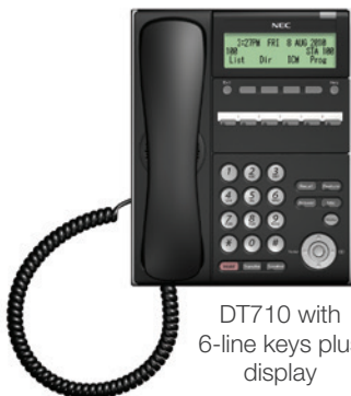
DT710 with 6-line keys plus display